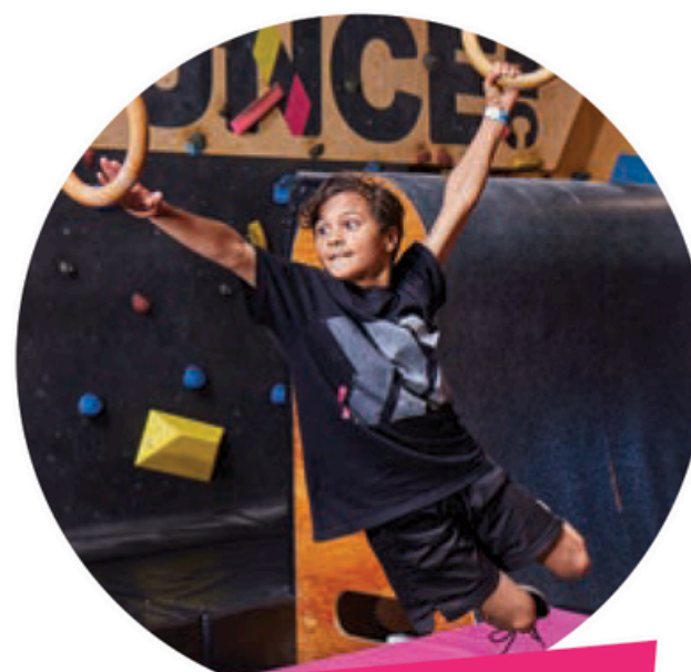
Years 1- 6